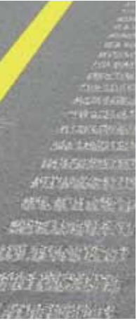
Photo of a rumble strip

Rumble strips are being installed on roadways across the U.S. in a manner that balances the needs of all roadway users, including bicyclists and motorcyclists.